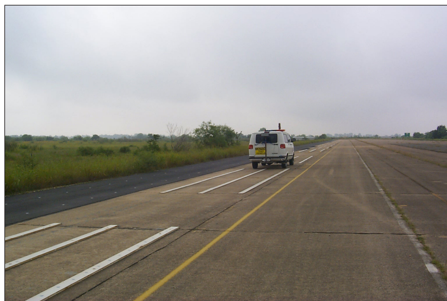
Figure 1. Scanner on Vehicle at the TTI Ride-Rut Facility.

For the static tests, readings from stationary scans of the scanning laser, the dip stick, the TMV profiler, and the straight edge were used to find the maximum and average maximum rut in both the right and left wheel paths. For the dynamic tests, rut