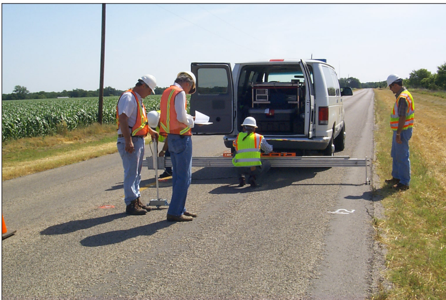
Figure 2. Dip Stick and TMV Profiler in Use at a Test Section near Granger, Texas.

The scanning laser system is ready for implementation at the project level. Additional studies, however, are needed to monitor its usage and/or modify the rut calculation and noise reduction procedures. Further studies could also be performed to consider usage of the system for other applications, such as estimating cut and fill design requirements for new pavements or improving maintenance on existing pavements.